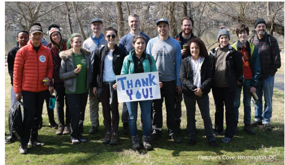
Fletcher's Cove, Washington, DC